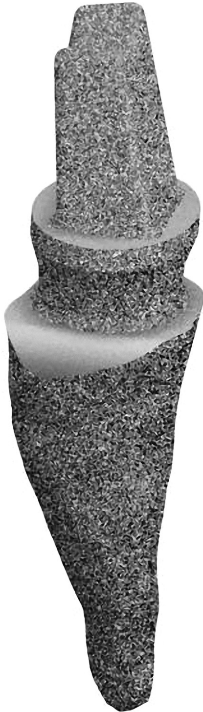
Fig. 2. The STL file of the custom-made RAI.

powerful ytterbium (Yb) fibre laser system (Eos Laser Systems R , Munich, Germany) with the capacity to build a volume up to 250 mm × 250 mm × 215 mm using a wavelength of 1054 nm with a continuous power of 200 W, at a scanning rate of 7 m/s. The size of the laser spot was 0.1 mm. This procedure allowed the creation of three incremental custom-made