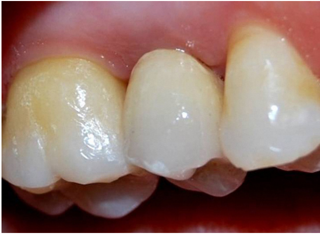
Fig. 3. The definitive restoration in situ 1 year after implant placement.